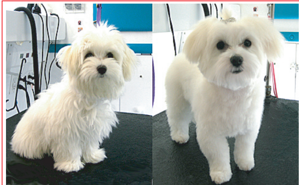
Dog Before & After Pictures

Cuts with ease. Showing Cutting Blades Up Front