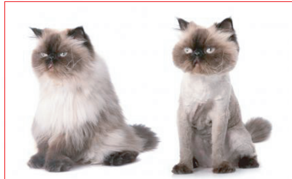
Cat Before & After Pictures